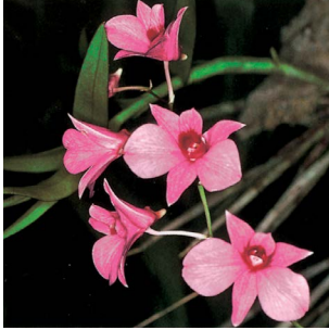
© Murray Fagg Australian National Botanic Gardens.